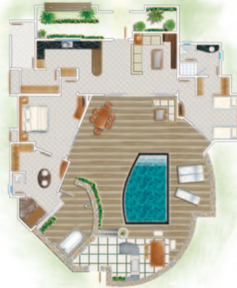
Pool Villa (2-bedroom)