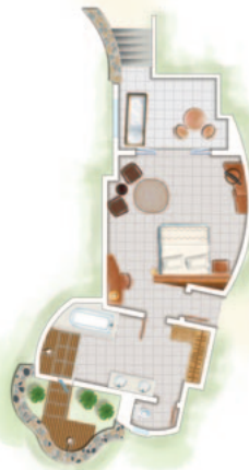
Tropical Junior Suite