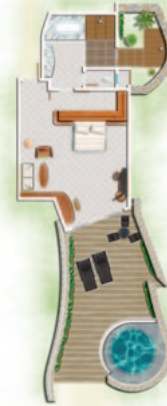
Beachfront Suite with pool