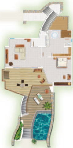
Beachfront Senior Suite with pool