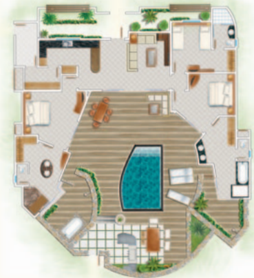
Pool Villa (3-bedroom)