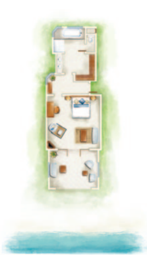
Tropical Room / Tropical Beachfront Room