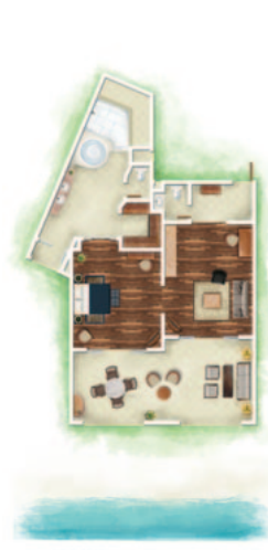
Senior Suite Beachfront