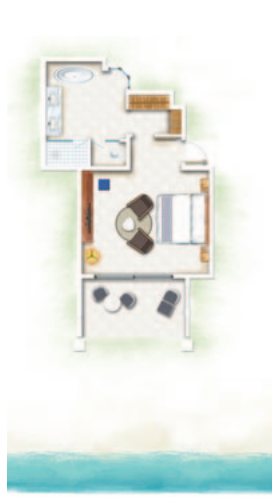
Ocean Beachfront Room