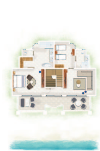
2-Bedroom Ocean Beachfront Family Suite