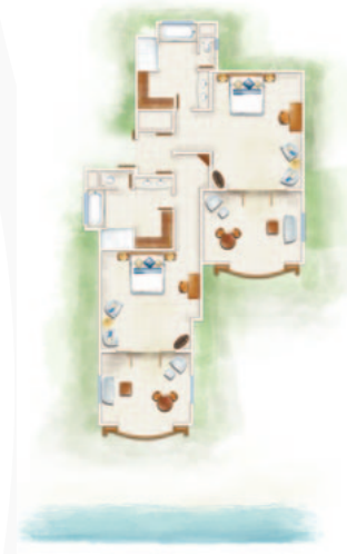
2-Bedroom Tropical Family Suite