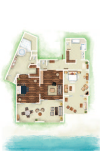
2-Bedroom Luxury Family Suite Beachfront