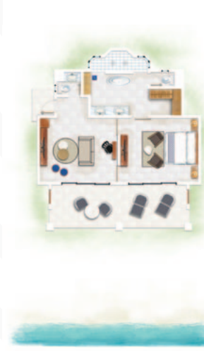
Ocean Beachfront Suite