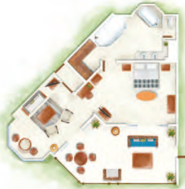
Club Senior Suite / Senior Zen Suite