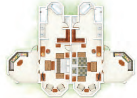
2-Bedroom Family Suite