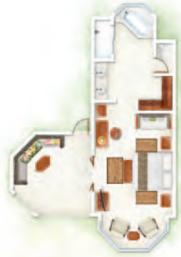
Junior Suite / Club Junior Suite / Club Junior Suite Beachfront / Zen Suite / Zen Suite Beachfront