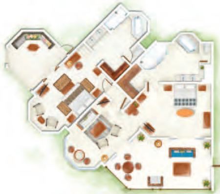
2-Bedroom Club Luxury Family Suite